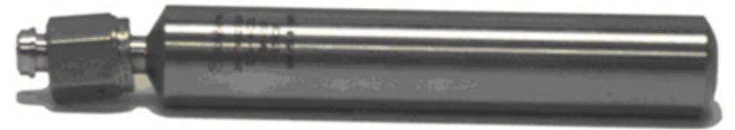
EP Cylinder Body

Swagelok® Trademark owned by Swagelok. Registered user in Canada, SWAGELOK Canada, Ltd. SWAGELOK AG is an authorized user in Switzerland of the SWAGELOK trademark.