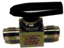
Standard Ball Valve