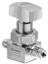
EP Male DP high pressure Diaphragm Valve