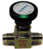
High Temp Bellows Sealed Valve