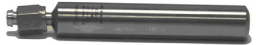
EP Cylinder Body

Swagelok® Trademark owned by Swagelok. Registered user in Canada, SWAGelok Canada, Ltd. SWAGelok AG is an authorized user in Switzerland of the SWAGelok trademark.