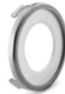
EP Unplated Gasket Assembly